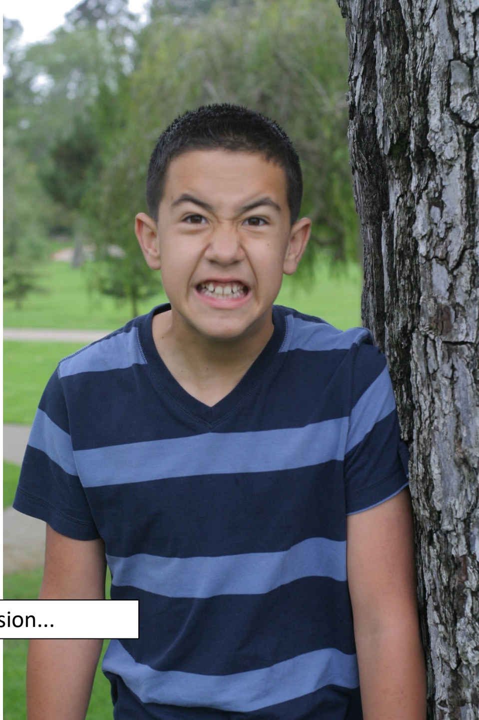
Before his conversion...